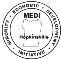
Early 2000 logo

To serve as a national model agency for growing and improving economies through small business and minority economic development.